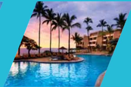
HAWAII, THE BIG ISLAND