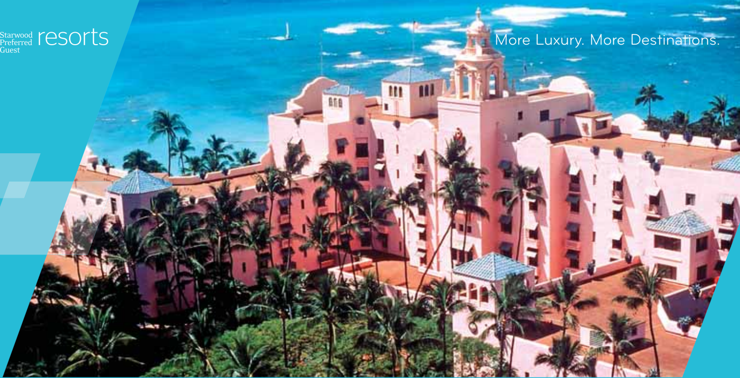
THE ROYAL HAWAIIAN, A LUXURY COLLECTION RESORT, WAIKIKI BEACH, O'AHU